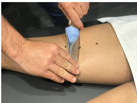
Fig. 1. Ergon IASTM treatment at 60 degrees angle application.

Participants received three treatments (one per week), which included the application of Ergon technique strokes at 20°,