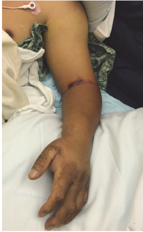
FIGURE 1: Appearance of the patient's arm prior to surgery.

on Adult Acute Lymphoblastic Leukemia) 2003 chemotherapy. He received cefepime and vancomycin for persistent neutropenic fevers. Eventually, cefepime was switched to meropenem due to development of multifocal pneumonia during his hospital course. Shortly thereafter, liposomal amphotericin was initiated for presumed invasive pulmonary aspergillosis after a bronchoalveolar lavage (BAL) from a diagnostic bronchoscopy revealed a positive galactomannan antigen; however no organisms were seen on gram stain or identified on culture. He was treated with vancomycin for 8 days and meropenem for 17 days, after which he defervesced. Nevertheless, fevers recurred on hospital day 20 and shortly after; blood cultures returned with gram-negative rods at which point vancomycin and cefepime were reinitiated.