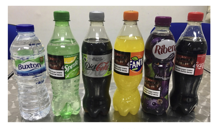
Fig. 3. Pictorial health warning labels placed on SSBs.

healthy snack options (2 of each); an intervention condition in which participants were presented with an increased number of healthier snack options (6 healthier, 2 less healthy); or an intervention condition, in which participants were presented with an increased number of less healthy snack options (2 healthier, 6 less healthy).