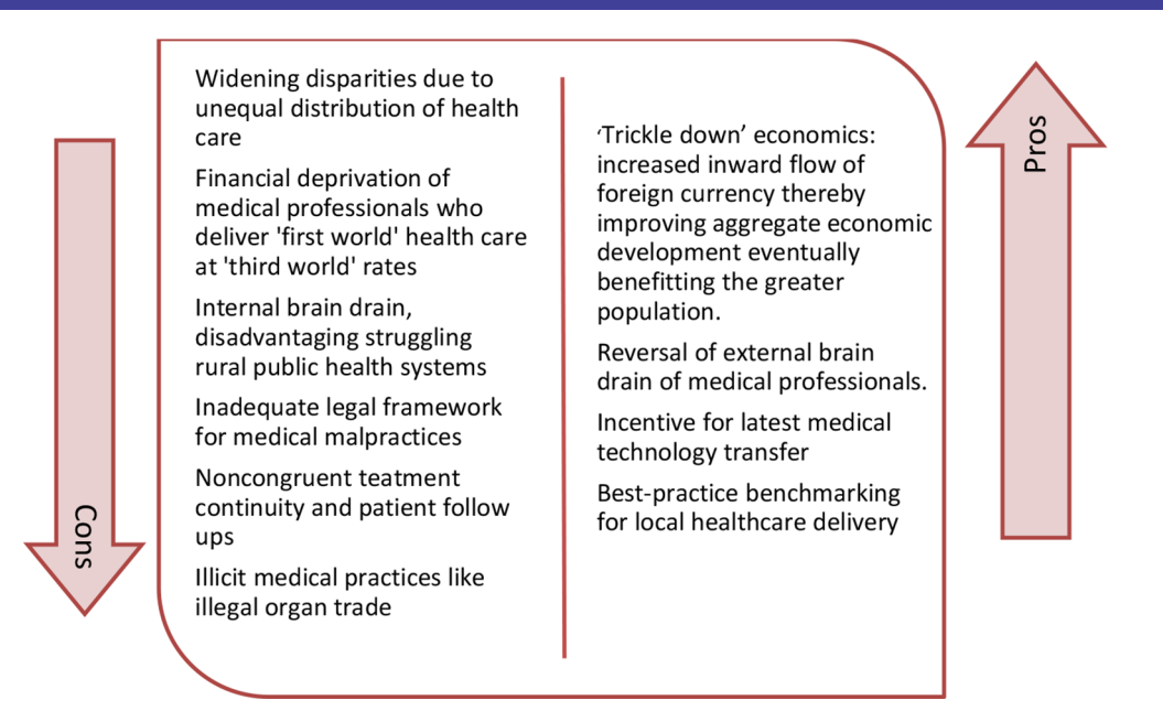
Figure 2 Advantages and disadvantages of medical tourism in Africa. (Source: adapted from Bookman and Bookman).<sup>11</sup>

by systematically reviewing available literature on the subject. The study will focus on MT flows out of, into and within Africa.