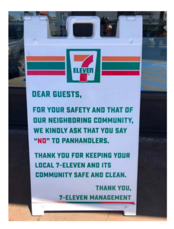
Figure 4. Location, Date: Central City of San Diego neighborhood, 07/04/2019. Image Description: A sign posted outside of the 7/11 convenience store that requests customers say "no to panhandlers" as a way to keep the store and local community "safe and clean". " This sounds like those signs that say 'don't feed the birds ".—Quotation from SHOWeD session.

The photovoice data in particular highlighted the stigmatization of homelessness as a key social and environmental determinant of health and well-being among TAY, echoing findings from past literature [13,46–48]. TAY participating in the community SHOWeD session and in the member-checking sessions also verbalized this point and suggested that stigma shaped how public health officials responded to the HAV outbreak. For example, many of the visual data points collected by the study team highlighted the various ways in which PEH and homelessness in general are stigmatized. For example, signs posted by local businesses used stigmatizing language about PEH (as demonstrated in Figure 4). SHOWeD analyses suggested that such language positions TAY and other PEH as a sub-human nuisance to the community who should not be offered help and support.