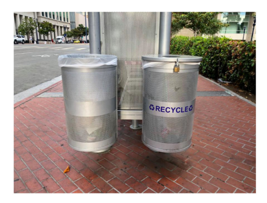
Figure 5. Location, Date: Downtown San Diego, 28/08/18. Image Description: Photo of two bins—an unlocked garbage bin next to a locked recycling bin. "This is symbolic of who should be protected and how a community can be clean, by not promoting [or] helping those who are poor and/or homeless". —Quotation from SHOWeD session.

The study team documented several other visual symbols and features of the social and built environment which were stigmatizing to PEH. For example, Figure 5 depicts an unlocked trashcan next to a locked recycling bin in downtown San Diego. In the accompanying SHOWeD and member-checking sessions, this photograph was interpreted by TAY as symbolizing that items of no monetary value (i.e., trash) are freely available, but that items that are cast aside yet have monetary value (e.g., recyclable cans and bottles) must be protected or have their access restricted—presumably from PEH, who might generate resources outside of the formal economy through the sale or trade of such items [14].