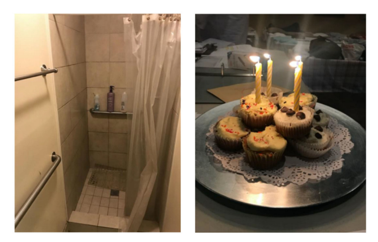
Figure 8. Location, Date: Emergency overnight shelter for TAY in central City of San Diego neighborhood, 21/08/2018. Image Description: [left] Photo of a shower for shelter guests; [right] photo of cupcakes with lit candles to celebrate a shelter guest's birthday. "[ This ] overnight [shelter is] where the youth can be free and not worry about the dangers of the outside world".; "[ The shelter ] is a pro and a con. You get a shower, food, clothing, but you only get [it for] a short time".—Quotations from SHOWeD session.

participation. For example, a TAY from one of the member-checking sessions explained: "You can't be young, Black, and trans[gender] in this city". Such testimonials highlight how intersectional oppression can further exacerbate the quality of experience with resources for TAY, or lead to the exclusion of some TAY from needed resources.