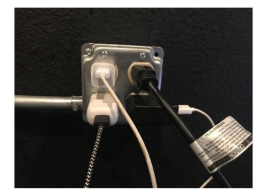
Figure 9. Location, Date: Emergency overnight shelter for TAY in central City of San Diego neighborhood, 21/08/2018. Photo Description: Photo of a power outlet with multiple power cords charging phones and other electronics. "Phones are so critical to get needs met, connecting to others. How often can TAY get access to power?" —Quotation from SHOWeD session.