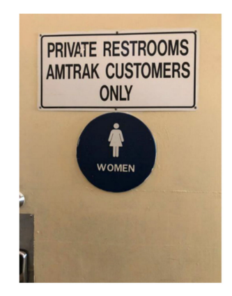
Figure 2. Location, Date: Downtown San Diego, 28/08/2018. Image Description: Close-up photo of a bathroom door at a train station; sign on door reads "Private Restrooms Amtrak Customers Only". "You can't [use the bathroom] unless you have a [train] ticket".—Quotation from SHOWeD session.