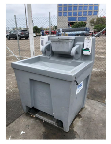
Figure 1. Location, Date: Downtown San Diego, 30/09/2018. Image Description: Image of a handwashing station on a public street; both dispensers are empty (one for hand soap, the other for hand sanitizer). "[Handwashing stations] gives us a false sense of [safety]".—Quotation from SHOWeD Session; "The County wouldn't have cared [about the HAV outbreak] if it didn't impact downtown or non-homeless people".—Quotation from member-checking session.