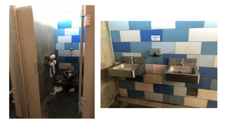
Figure 3. Location, Date: Beach neighborhood on south coast of San Diego, 21/08/2018. Image Description: Two photos of the women's public bathroom—[Left] bathroom stall with toilet and toilet paper strewn on ground; [Right] two sinks with empty soap dispenser. "That place should've been clean. At least, like inside that spot around that area should be clean for everybody to go to a clean spot instead of the dirtiness they always know". —Quotation from SHOWeD session.

Figure 2. Location, Date: Downtown San Diego, 28/08/2018. Image Description: Close-up photo of a bathroom door at a train station; sign on door reads "Private Restrooms Amtrak Customers Only". "You can't [use the bathroom] unless you have a [train] ticket".—Quotation from SHOWeD session.