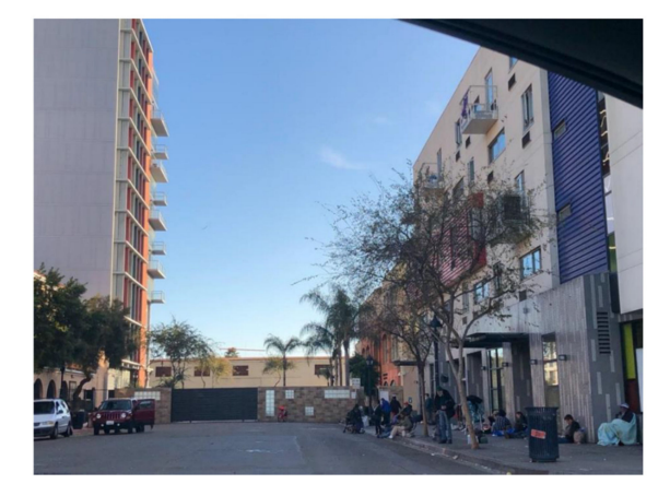
Figure 6. Date, Location: Downtown San Diego, 23/09/2018. Image Description: A wall separating the street view from the courtyard of a large service organization where TAY and other PEH access meals, showers, and other resources. "There's so many little things [the organization] could be doing, but literally all they have is the wall and then the resources [on the other side]. Like, they don't care about anything else, as long as the [people] are hidden". —Quotation from SHOWeD session.