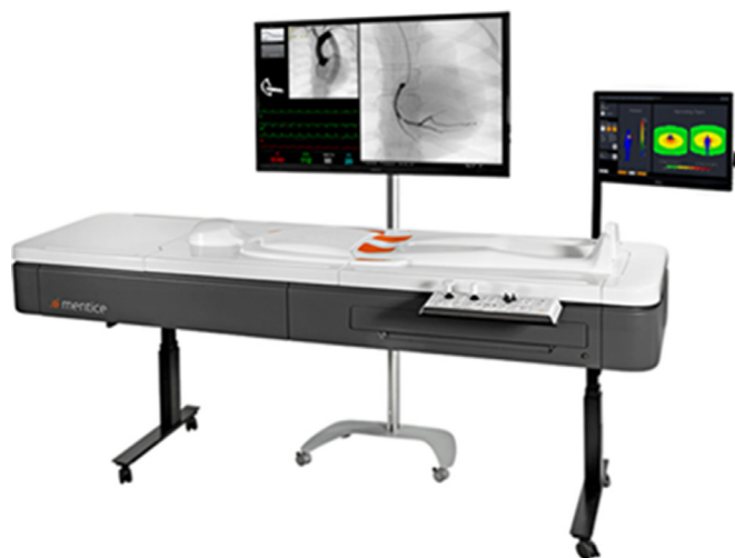
Figure 1 The vascular interventional simulation trainer (VIST) virtual reality simulator.

endovascular simulator which enables hands on procedural training for clinicians using real patient cases. This technology allows the use of the medical devices for simulated endovascular procedures. In replicated real world scenarios, it provides step by step guidance and metric based feedback throughout the procedure. 15 16 The haptic feedback to the users' actions are calculated in real time and depend on the interaction between the virtual devices and the virtual anatomy (vessel geometry and vessel properties), and give realistic tactile feedback to the operator during the training procedure. 15 16