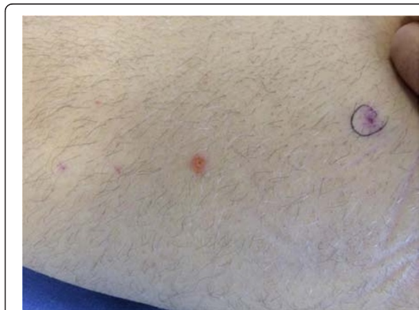
Fig. 3 Eruptions demonstrating generalized herpetic rash at day 8 following intensive care unit admission (left thigh)

In the light of the available literature, HSV-2-induced multiple organ failure is a rare condition. HSV infection in adults is commonly associated with cutaneous facial (HSV-1) or urogenital infections (HSV-2) [4]. Of interest, approximately 60 % of the Western population is HSV-1 colonized, whereas HSV-2 colonization occurs in approximately 12 % of cases [4]. Oral HSV infection in adults may present as severe pharyngitis accounting for approximately 6 % of cases in young adults. However, HSV-2