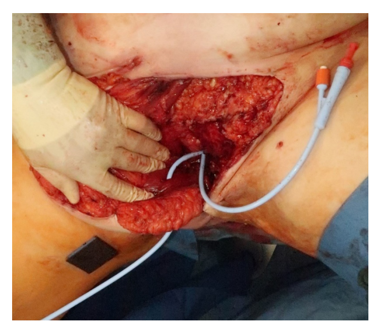
Figure 4. The VRAM flap was tunneled subcutaneously in an extrapelvic route to be placed into the perineal defect. A urinary catheter was tunneled through the middle of the VRAM flap and into the bladder through the remaining urethra. The old urinary catheter is still in place.

A urinary catheter was tunneled through the middle of the VRAM flap, protecting the vascular pedicle, and inserted into the bladder through the remaining proximal urethra, measuring 2 cm (Figure 4). Afterwards, the flap was sutured into the defect and showed adequate perfusion (Figure 5).