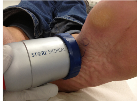
Figure 2 High-energy focused extracorporeal shockwave therapy (ESWT, Storz Duolith SD1) in plantar fibromatosis (Ledderhose's disease).

(ESWT), which was introduced from urologists in order to destroy kidney stones, has been tested in penile fibromatosis (Evidence level Ib) [5]. Another study reported that about half of all ESWT treated patients had a significant reduction in penile angulation [6]. Given these observations in penile fibromatosis, we started to perform a randomized-controlled trial to evaluate high-energy focussed ESWT in palmar fibromatosis, Dupuytren's contracture (DupuyShock) [7].