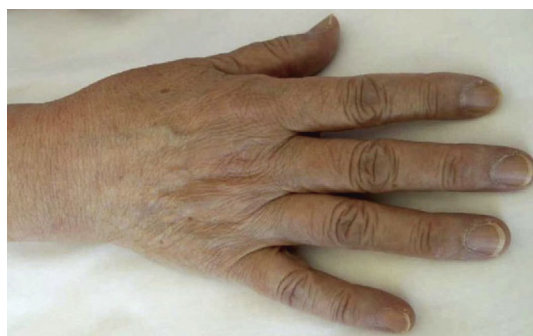
Figure 2. Clinical presentation on admission to our hospital. Gottron's sign, periungual erythema, and mechanic's hands were not observed.

revealed mild weakness of the gluteus maximus muscle on both sides (MMT score, 4/4). On chest auscultation, heart sounds were clear, but fine crackles were audible over bilateral lower lung fields. A laboratory evaluation revealed slight elevation of aldolase at 11.1 U/L (normal range: 2.1-6.1 U/L), whereas creatinine phosphokinase and myoglobin were within normal range. In addition, levels of C-reactive protein, lactate dehydrogenase, aspartate aminotransferase, and alanine aminotransferase were slightly elevated (0.35 mg/dL, 264 U/L, 48 U/L, and 95 U/L, respectively), and levels of serum ferritin and KL-6 were elevated (344 ng/mL and 822 U/mL, respectively). Results of immunologic tests were negative for antinuclear antibodies, anti-aminoacyl-tRNA synthetase antibodies and anti-neutrophil cytoplasmic antibodies. An arterial blood gas analysis on 0.5 L/min oxygen showed hypoxia (PaO 2 , 80.5 Torr). The percentage vital capacity predicted (%VC) was very low, 35.4% on admission, and because of this, the percentage diffusing capacity of the lung for carbon monoxide predicted was not evaluated.