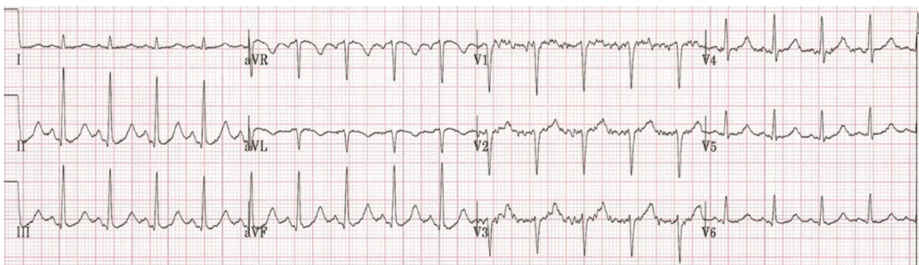
Fig. 2 Sinus tachycardia with no ST segment depression in the same patient with core body temperature of 93°F after 2 h of external warming

The mechanisms of atrial fibrillation (A-fib) triggered by hypothermia are still not fully understood and probably multifactorial. Under the circumstance of hypothermia, the sympathetic nervous system is activated with the release of