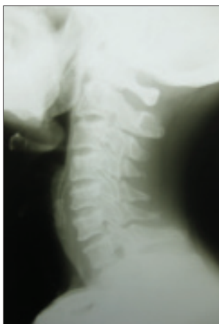
Figure 1: Preoperative lateral view neck radiograph showing thumb sign