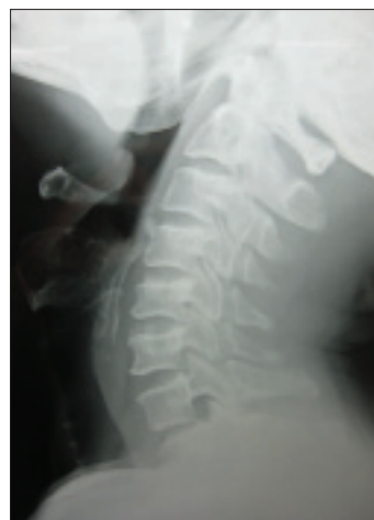
Figure 2: Postoperative X-ray