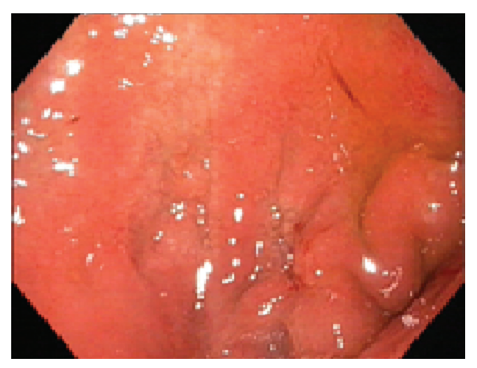
Figure 4: EDG at 8th week revealed healed duodenal ulcer without any evidence of hematoma

the underlying fixed submucosa and serosa resulting in rupture of submucosal vessels and subsequent formation hematoma in predisposed individuals. Furthermore, intermittent systemic anti-coagulation during maintenance HD might have contributed to this complication in our case. Earlier, cases with duodenal hematomas subsequent to endoscopic interventions have been reported, [7,8] including in patients with ESRD and cirrhosis. [9,10] To our knowledge, this complication has never been reported from India.