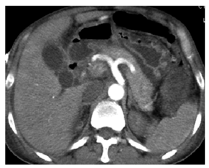
Figure 3: Contrast-enhanced abdominal CT scan showing a large hematoma at the duodenal wall