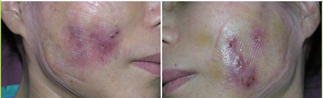
Fig. 3. Case 2

A 50-year-old woman who had undergone autologous fat grafting to both cheeks developed bilateral erythematous nodules and purulent discharge.