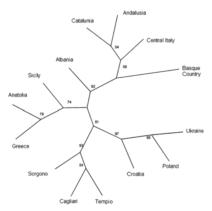
Figure 3. UPGMA consensus tree correlating European populations constructed using 1000 R_{\rm ST} pairwise distances. Numbers before forks indicate percentage of times that each group appeared in the input trees

interest. We found a value of 9.5 (6.7-13.7) KYA for the Anatolian population, whereas two data sets of West-Balkan and Iberian populations provided a signal of initial expansion of 7.4 (6.5-16.1) and 9.8 (9.5-13.7) KYA respectively. BATWING analysis also suggested an effective population size at the beginning of the