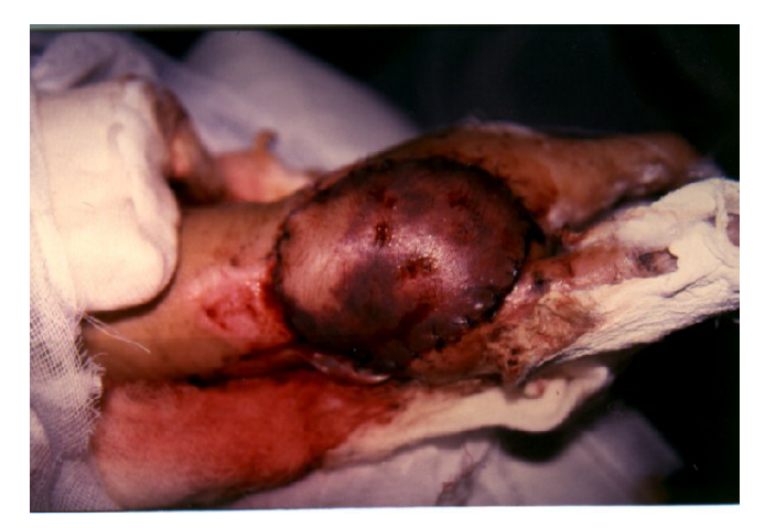
Figure 2 Venous insufficiency of the posterior interosseous flap used for defect reconstruction.