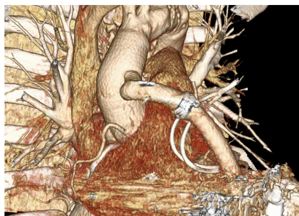
Figure 3. Postoperative computed angiogram, 3d reconstruction showing the ascending aortic "anteflow" prosthesis with the branch connected to the LVAD outflow graft.

The surgical complication rate after left ventricular assist device (LVAD) implantation is high, due to complicated cases in patients with various comorbidities. Especially bleeding rates of up to 30 percent have been reported [2]. The most common complication is however infection related. Other reported complications are thrombus related or malfunction of the device itself [3,4]. Iatrogenic aortic dissection after cardiac surgery using Cardiopul-