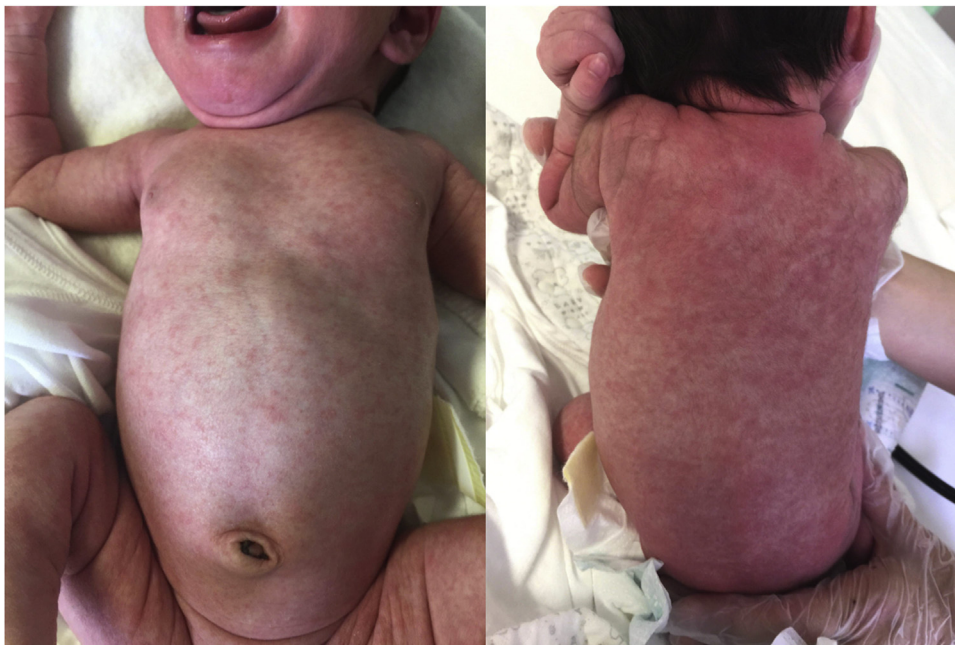
Fig. 2. Maculopapular rashes all over the infant.

However, 2 days later, the infant developed a fever as well as a rash that spread from her face to the trunk of her body (Fig. 2). Subsequently, she was diagnosed with neonatal measles after positive confirmation by PCR analysis of her throat swab and urine and blood specimens. Her chest X-ray showed signs of pneumonia. She developed respiratory distress and was transferred to another hospital for further treatment. Eventually, she showed complete recovery and was discharged without any further complications after 10 days of inpatient treatment. We also offered measles vaccine or serologic testing to 10 members of the hospital staff and five patients who were exposed to the index patient in the ER. The local health department followed up approximately 150 people, including some newborns and pregnant women who might have