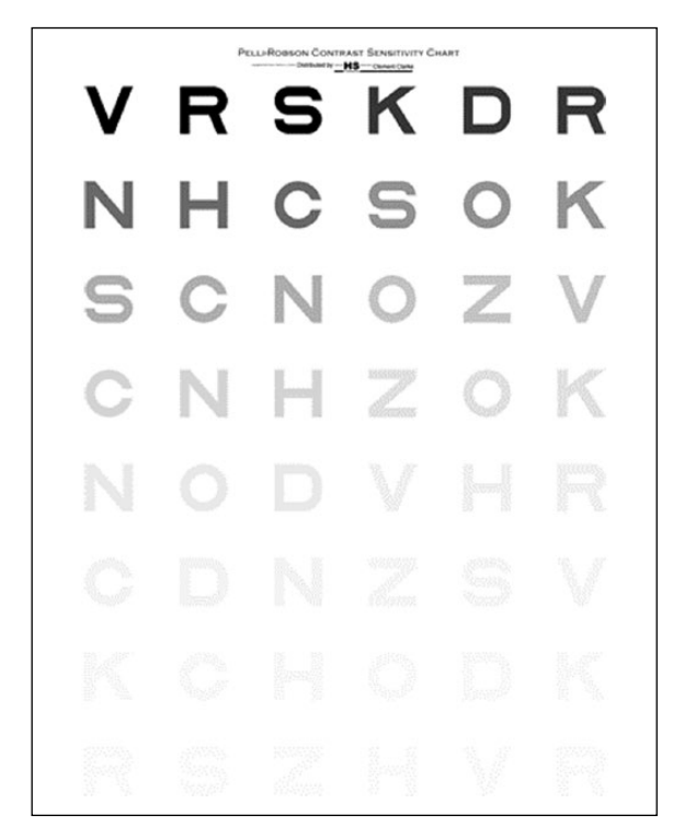
Figure 2. Pelli-Robson contrast sensitivity chart (Precision Vision, LaSalle, IL)<sup>11</sup> The Pelli-Robson contrast sensitivity charts have uniformly large (20/680 Snellen equivalent size) letters of decreasing contrast in a series of triplets. There are two triplets per line and all letters within each triplet have the same contrast level. The Pelli-Robson chart is read at 1 m. It is wall or easel mounted; therefore, luminance of the environment must be accounted for when used for research.

Reprinted with permission from Pelli et al.<sup>11</sup> Copyright © 2014 D.G. Pelli and J.G. Robson. Manufactured by Precision Vision.