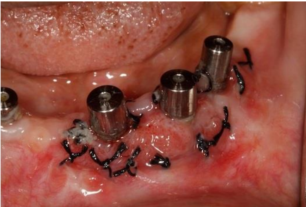
Figure 6: After 8 days, new immature blood vessels seen