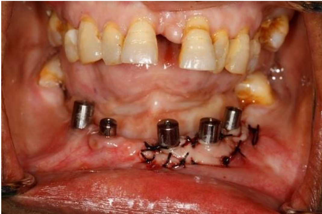
Figure 3: Vestibuloplasty with PRF membrane in 3 rd quadrant