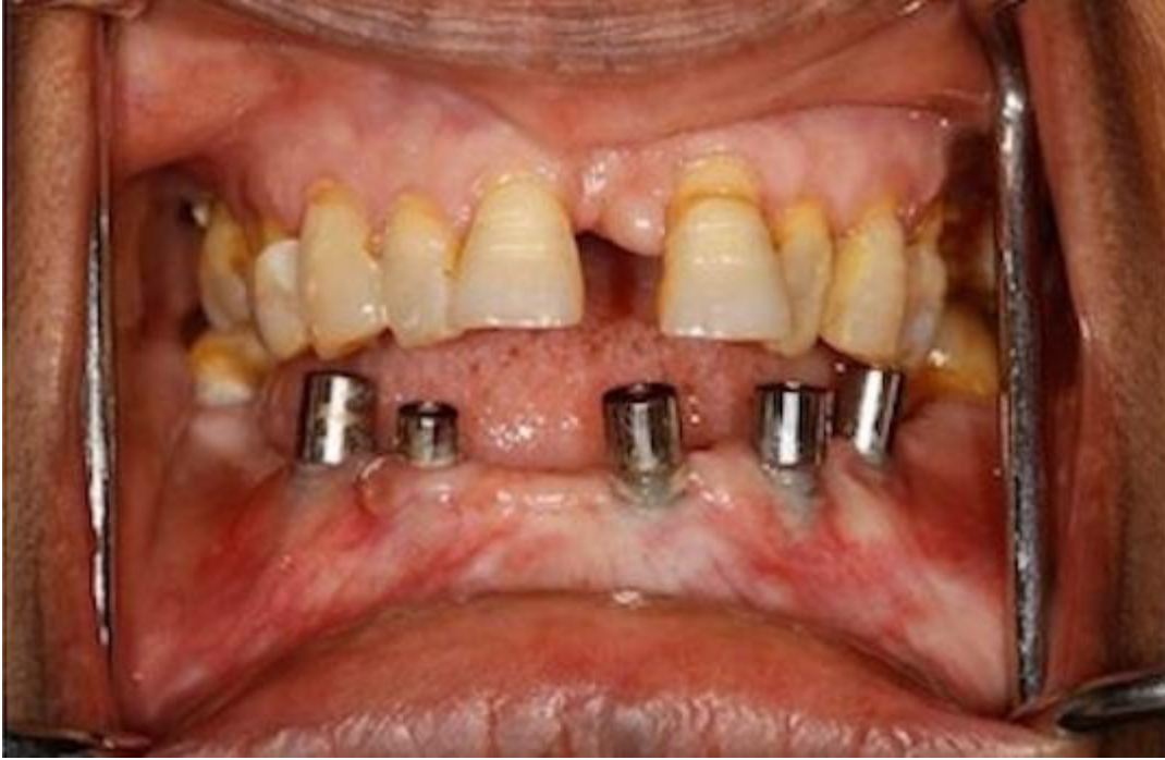
Figure 1: Pre operative