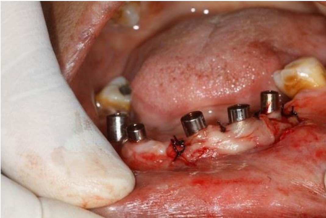
Figure 2: PRF membranes secured with sling sutures