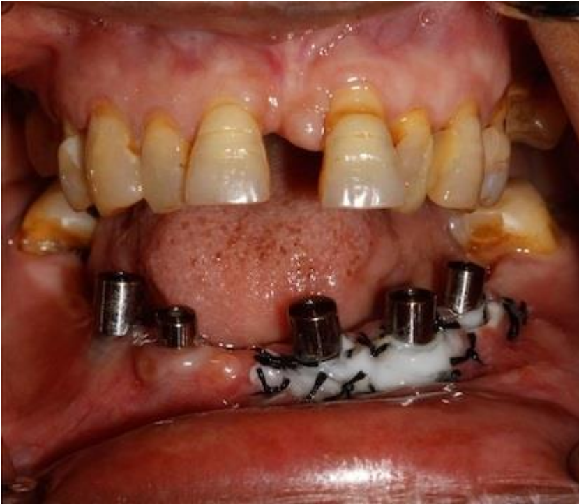
Figure 5: Day 1 after surgery, PRF membrane whitish in colour