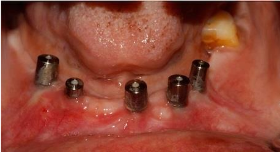
Figure 7: After 4 week, sufficient coverage of exposed implant surface