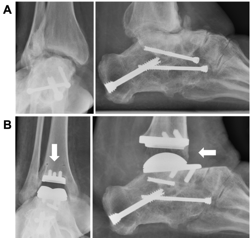
FIGURE 3: A) Preoperative and B) postoperative anteroposterior and lateral radiographs of an adult patient with previously operated clubfoot with ankle arthritis who underwent total ankle arthroplasty

arthroplasty in a clubfoot patient, or a patient with a diagnosis of clubfoot in reports on total ankle arthroplasty, be found in the literature review. This might be attributable to reduced preoperative subtalar mobility, which could result in a higher rate of early loosening after total ankle arthroplasty, or abnormal talar morphology and size precluding total ankle arthroplasty in clubfoot patients [21-22]. However, total ankle arthroplasty has been performed in adult patients with previously-treated congenital clubfoot (Figure 3). Thus, while total ankle arthroplasty may be an operative option for ankle arthritis in adult clubfoot patients, such cases are not yet reported in the literature and the true frequency of such procedures remains unknown. Therefore, future studies are needed to describe the efficacy and outcomes of total ankle arthroplasty performed on adult clubfoot patients.