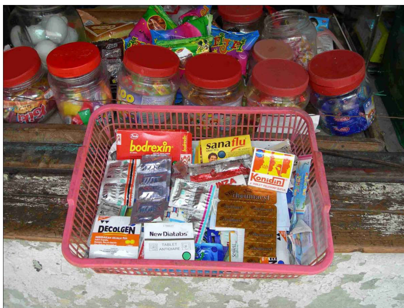
Figure 2 Antibiotic sample in a kiosk (roadside stall) in a street of Surabaya.

The availability of antibiotics in other medicine outlets, that are not licensed for prescription-only drugs, differed. Drug stores hardly retained any antibiotics. This was confirmed by a repeat visit to a few drug stores in 2007 (data not given). Former actions by the national