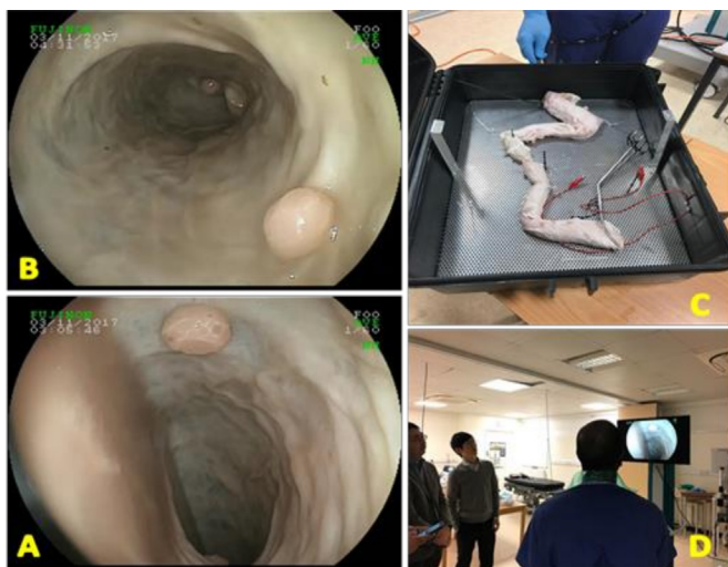
Figure 2 Images (A) and (B) are examples of the phantom polyps as viewed by the endoscope in the pig colon model. Image (C) shows the pig colon model being scoped. Image (D) shows the real-time endoscopy view during the experiment.

Polyp size is related to the risk of cancer and influences surveillance intervals and therapeutic approaches. 1 The 5 mm threshold is particularly important because it influences the implementation of optical diagnosis-based strategies including resect and discard/diagnose and leave approaches and also allows endoscopists to make therapeutic choices of cold versus hot polypectomy. 2 However, visual size estimation by endoscopists has a significant interobserver variability and error rate, 3 and other methods showed variable and sometimes contradicting results. 4