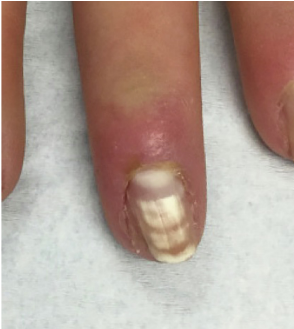
Fig. 1. Clinical photograph of the right third fingernail with parallel bands of leukonychia and erythema involving the nail folds.