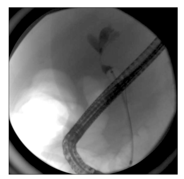
Figure 2. Cholangiogram showing a stricture at the level of hepatic bifurcation with significant proximal dilation.

Cytologic analysis of the FNA sample of the pancreatic head mass with Diff-Quik and Papanicolaou stain showed malignant cells with glandular differentiation, significant nuclear pleomorphism, crowding, 3-dimensional clustering, and prominent