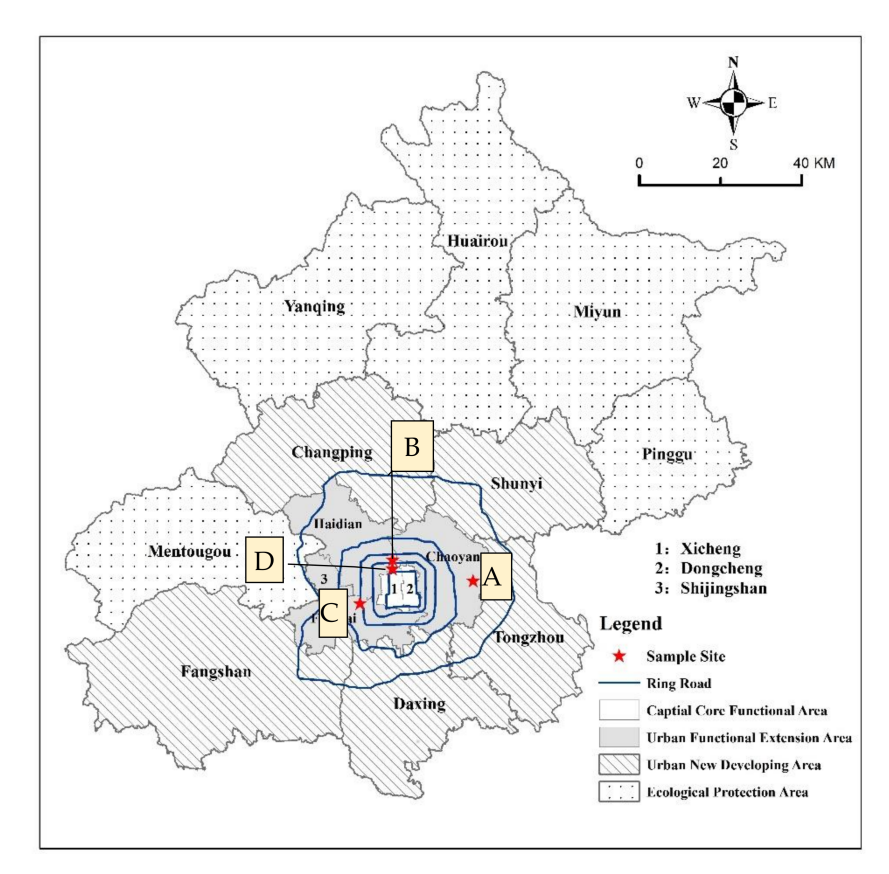
Figure 2. The location of the case study sites.