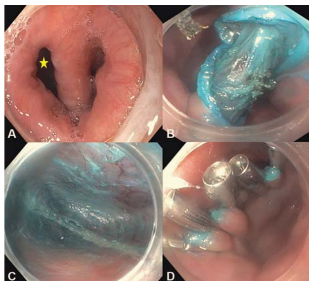
Fig. 2 (A) Endoscopic view of Zenker's diverticulum. Yellow star indicates the diverticular side. (B) Cricopharyngeal muscle exposed after tunneling. (C) Complete myotomy. (D) Clip closure of mucosal edges.

We use a HybridKnife I-Type I-Jet (Erbe, Tubingen, Germany). The initial 1.5- to 2-cm vertical mucosotomy