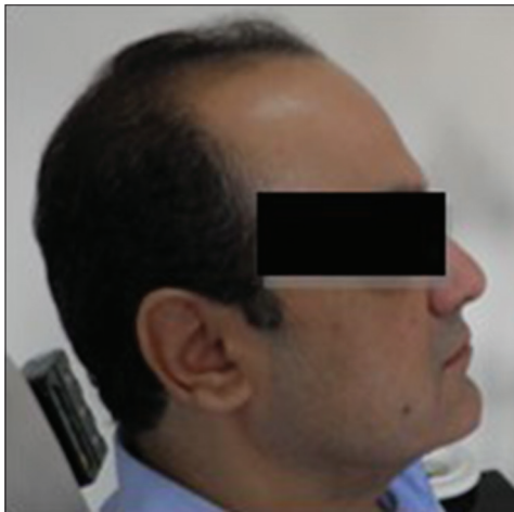
Figure 5: Patient's preoperative profile picture

The adhesive technologies currently available allow bonding of veneer or onlay restorations to the remaining tooth structures even if the remaining structure