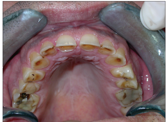
Figure 2: Palatal view of the tooth wear