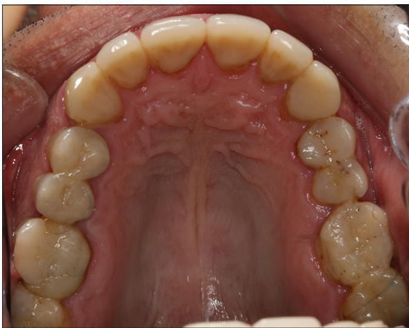
Figure 14: Direct composite repair at tooth 25

is <3 mm. Although adhesive restorations offer several advantages, significant care must be taken while bonding the restoration to dentin. [35,36]