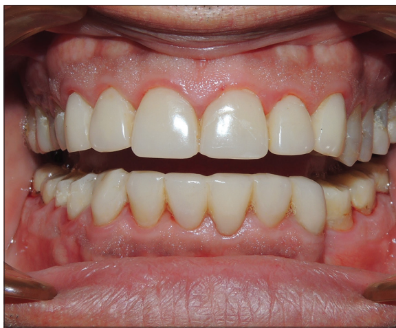
Figure 12: Restorations at 4 years (opened occlusion)