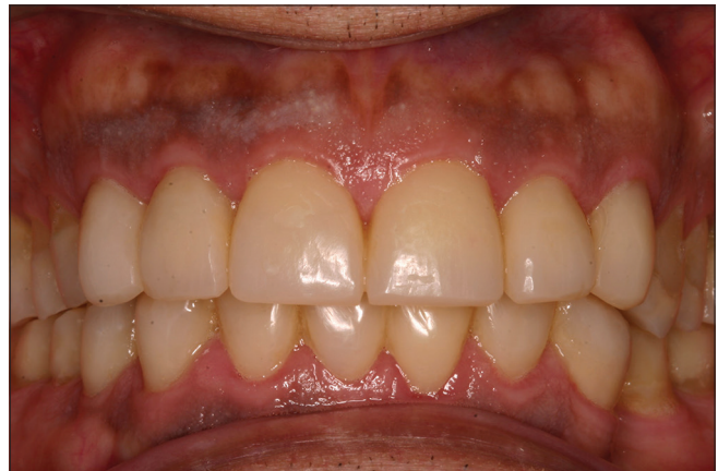
Figure 8: Postoperative result