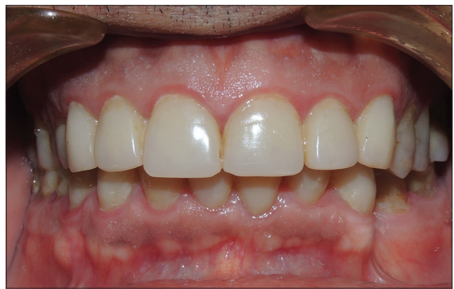
Figure 13: Restorations at 4 years (closed occlusion)