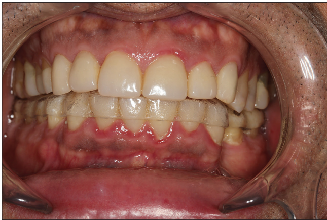
Figure 10: Night guard applied on the lower arch