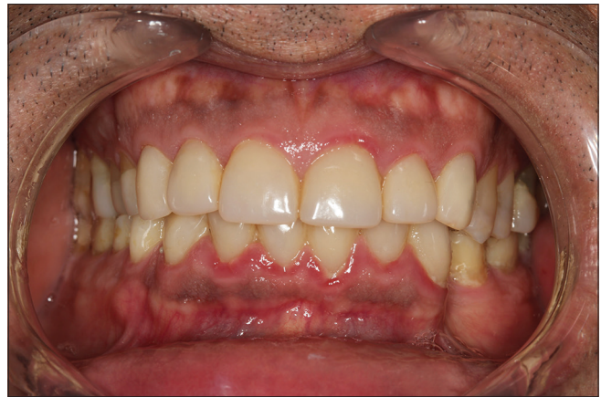
Figure 11: Picture of the restorations at 1 year