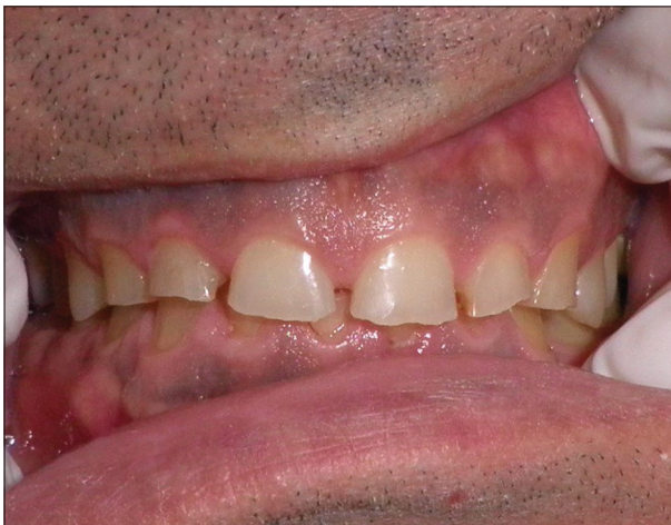
Figure 7: Preoperative status