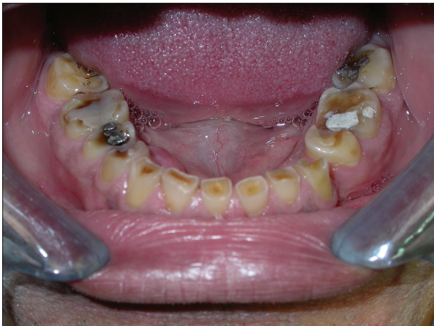
Figure 1: Lingual view of the tooth wear

Luting of the restorations was made in two stages: teeth preparation and prostheses treatment.