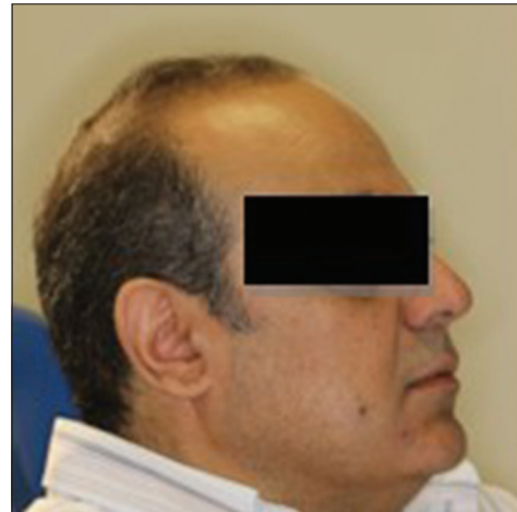
Figure 6: Patient's postoperative profile picture