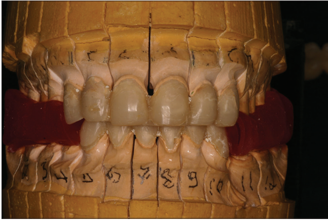
Figure 4: Model showing the increase of the vertical dimension

Teeth preparation consisted in cleaning temporary cement, etching using phosphoric acid (37%), and applying a fifth-generation adhesive system, single bond (3M-ESPE, St Paul, USA) on teeth surfaces.