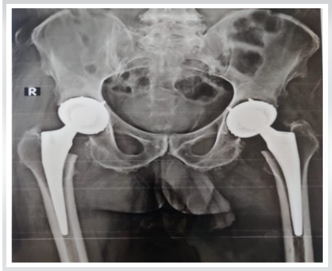
Figure 4: Post-op X-ray showing implant insitu.

The patient was admitted to the hospital for the complaint of painful hip joints, causing a limp, and so underwent THA bilaterally in 2 sittings with an interval of 17 days, by