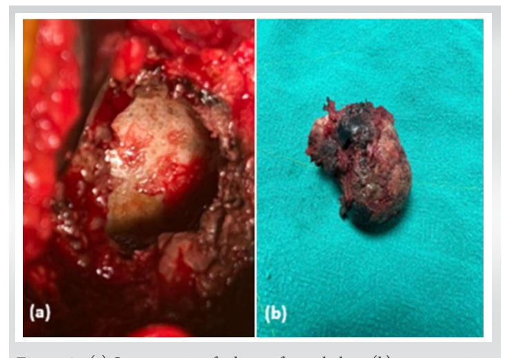
Figure 2: (a) Intraoperative findings of acetabulum (b) post-operative extracted capsular femoral head.

without any increase in lumbar lordosis. Bilateral Hip joint flexion of up to 90° degrees was possible with painful restriction of internal and external rotation of the hips when the hips and knees were extended and in 90° of flexion. Radiological examination revealed severe degenerative changes of both knee and hip joint with tendinous calcification of the pelvis; spinal Xray reveals ankylosis straightening of the lumbar lordosis with striking calcification of the intervertebral disc. Magnetic resonance imaging of the spine showed widespread involvement of the cervical and lumbar vertebrae with disc herniation at multiple levels (C4-5,C5-6,C6-7, T12-L1,L5-S1) (Fig. 1) without canal compromise at both cervical and lumbar spine with relative sparing of the dorsal vertebrae.