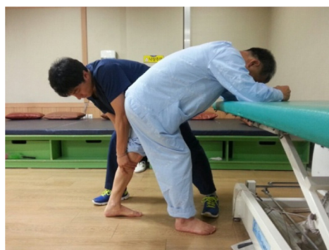
Fig. 1. Ankle plantar flexors stretching position