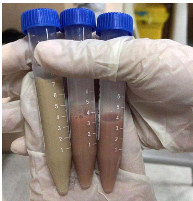
Figure 3 Appearance of the pleural effusion, showing purulence and a reddish-brown color.

The patient's condition deteriorated over the next few days, with increased chest tightness, shortness of breath, and fatigue. Despite the addition of methylprednisolone and meropenem, together with noninvasive ventilator support, his condition continued to decline. The laboratory results indicated further deterioration, with a reduced oxygenation index (166 mmHg), worsening blood counts, and signs of multi-organ dysfunction. Gram staining of sputum smears showed positive bacilli (Figure 4A) and acid-fast-bacterial staining showed weak positivity (Figure 4B). Finally, after culture on Columbia blood agar medium, the VITEK test ® and mass spectrometry identified the Nocardia otitidiscaviarum (Figure 4C). The pleural fluid also tested positive for N. otitidiscaviarum . The patient was thus diagnosed with severe N. otitidiscaviarum infection and sepsis, and was treated with linezolid, ciprofloxacin, Sulfamethoxazole, and nutritional support. Despite these measures, his condition deteriorated rapidly.