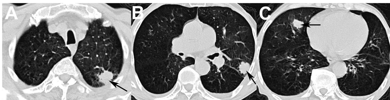
Figure 1 (A): Nodule in the upper lobe of the left lung (black arrow), showing blurred boundaries with slight pleural effusion on the left side. (B): Left upper lung subpleural nodule (black arrow), diameter 2.2 cm, with visible lobulation and limited pleural effusion on both sides. (C): Nodule in the middle lobe of the right lung (black arrow), with small amount of pleural effusion on both sides and bronchiectasis in both lower lungs.

His body temperature was normal on admission, with scattered dry and wet rales audible in both lungs. Laboratory tests revealed a reduced oxygenation index (248 mmHg), elevated WBC and neutrophil counts ( 20.9 \times 10^9/L ), a reduced lymphocyte count ( 0.2 \times 10^9/L ), a CRP level of 198.3 mg/L, a procalcitonin (PCT) level of 1.74 ng/mL, and hypoproteinemia (22.3 g/l). He was then treated with cefoperazone sulbactam and voriconazole injections.