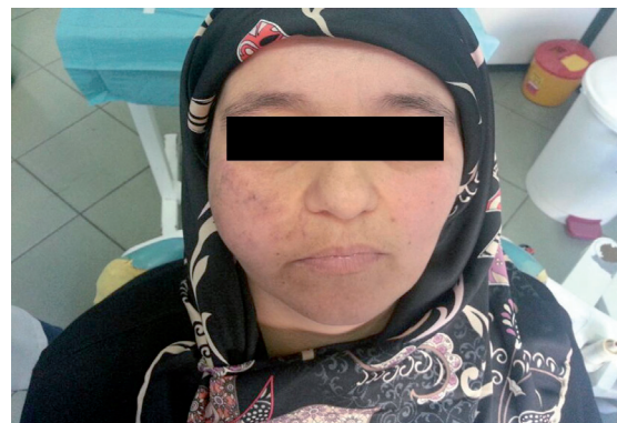
Figure 1. Asymmetry and discoloration at patient's right cheek.

right facial fatty tissues and near premaxillary area. Lesion demonstrated hyper intensity at T2A sequences and also in peripheral contrast enhancement on MRI. Therefore, it was concluded that the lesion did not reach the alveolar crest (Figure 4). Teeth numbered 12 and 13 were extracted following local anesthesia, gelatin sponges (SPONGOSTAN™, Ferrosan, , Denmark) were placed in the sockets and the wound was sutured (Figure 5). Hemostasis was obtained and sutures were removed at postoperative 7th day. Healing was uneventful.