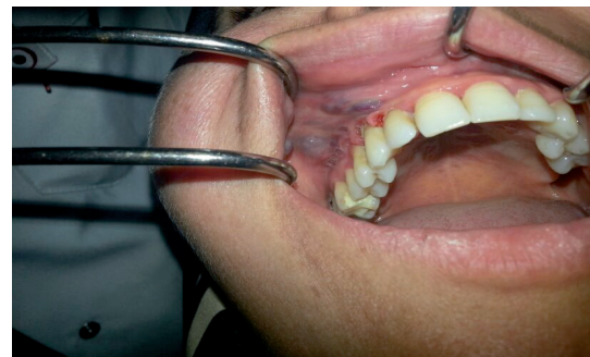
Figure 2. Intraoral appearance of cavernous hemangioma.