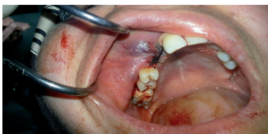
Figure 5. Postoperative intraoral appearance.