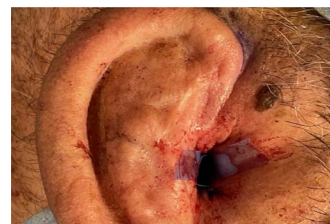
Figure 5. Surgical repair, formation of the new external canal.

Congenital aural atresia may be found from the early stages of life, but the time of surgical repair depends on several factors. According to the literature, congenital aural atresia refers to an anatomical malformation