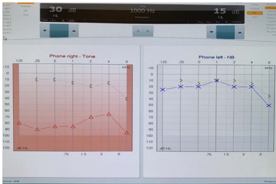
Figure 2. Audiogram test.