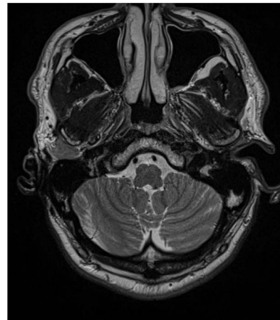
Figure 4. MRI atretic temporal bone right side.

auricle (Figs 3 and 4). There was a normal anatomy of the internal auditory canal on both sides. Left side of the external auditory canal was normal. Diagnosis of this anatomical malformation was compatible with congenital atresia of the external auditory canal on the right temporal region. The patient decided to proceed to surgery many years after the first diagnosis. Some weeks ago, canalplasty and tympanoplasty were performed by our surgery team. During surgery, a graft has been obtained in order to formate the covering of the new canal. The incision was made behind the ear at the level of temporal bone, and the graft needed is removed from the temporal fascia and inserted as covering of the new canal. The aim is to create a new anatomic pathway resembling a normal external acoustic canal by drilling the atretic bone and removing the present tissue (Figs 5 and 6).