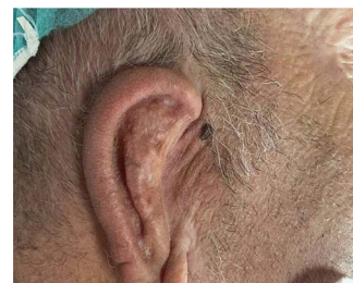
Figure 1. Preoperative image with the atretic temporal bone.

A 56-year old male was presented in the Outpatient Department of Otolaryngology Clinic with main complaint of complete aural atresia of the right ear. The clinical examination revealed that there was no external auditory canal in the right ear (Fig. 1) and hearing loss was altered (Fig. 2). There was no symptomatology in the left ear and the anatomic structures were completely normal. Blood test was normal, and there were no other medical issues from the personal history. The computed tomography (CT) scan and mainly the magnetic resonance imaging (MRI) of the temporal bone revealed no mastoid air cells and no external auditory canal and