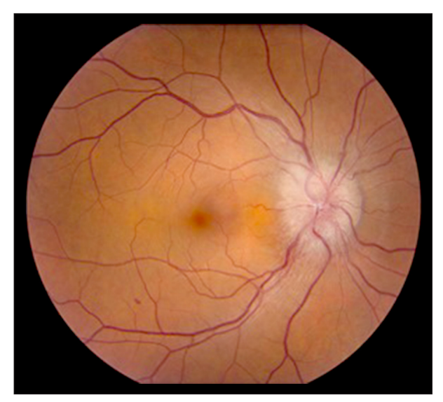
Figure 1. Funduscopic examination of a patient with optic neuropathy demonstrating an edematous, pale optic

Physical examination revealed no skin rash, normal cardiac and lung auscultation, and a normal abdominal examination. Neurological examination revealed normal strength and sensation in the upper and lower extremities and cranial nerves I and III-XI were grossly intact. Ophthalmologic examination revealed that she was unable to perceive light (NLP) with the right eye and the visual acuity of her left eye measured 20/25. Near vision without correction was nil on the right and a brisk Jaeger 1 on the left. Color vision was nil on the right and she was able to identify 10 out of 10 Hardy-Rand-Rittler plates on the left. Visual fields to confrontation on the right side revealed that the patient could see hand motion in her temporal field only. Visual fields were full to confrontation on the left side. Pupils were 3 mm being nonreactive on the right and 1+ reactive on the left and there was a 2+ right relative afferent pupillary defect evident. The patient was orthophoric at distance with full ductions, versions, pursuit, and saccadic eye movements. There was no significant ptosis, enhanced ptosis, lid lag, or lid retraction noted. Cranial nerves V and VII were intact including normal corneal reflexes. Ocular tensions were 12 and 17, respectively. Slit lamp examination was essentially normal each eye. Fundoscopic examination revealed marked optic disc swelling with a markedly diffusely pale optic disc