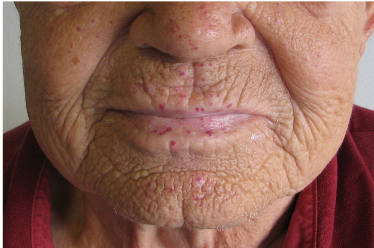
Fig. 1 Typical telangiectatic lesion in an HHT patient

possible [17]. Other neurological symptoms may be caused by cerebral arteriovenous malformations (CAVMs), which are present in at least 10% of patients [18]. Hepatic arteriovenous malformations (HAVMs) are quite common, but rarely symptomatic [2, 19]. Clinical reports show an apparent increased occurrence of bacterial infection [13–15], and an apparent increased occurrence of thromboembolic events, and certainly an increased occurrence of non-traumatic haemorrhage [2, 5].