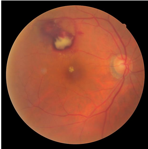
Fig. 1. Her right fundus showed the first ruptured RAM at the superotemporal vascular arcade with subintimal limiting membrane and subretinal hemorrhages not involving the macula. During her first visit, her BP was 163/77 mm Hg with no medications. Her VA was 20/25.