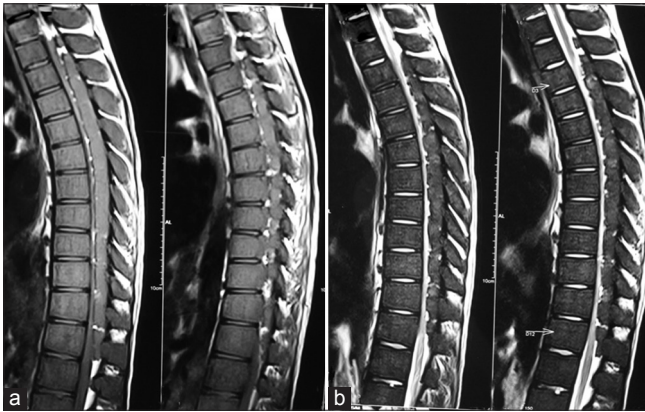
Figure 1: (a) MRI dorsal spine T1WI sagittal sections revealing an isointense epidural lesion posterior to the cord extending from D2 to D12, (b) MRI dorsal spine T2WI sagittal sections revealing an isointense to hyperintense epidural lesion posterior to the cord extending from D2 to D12. Note is also made of isointense to hypointense signal of vertebral bodies on both T1WI and T2WI along with coarsening of trabecular pattern, suggestive of hypercellular bone marrow

The magnetic resonance imaging (MRI) of the thoracic spine revealed a posterior, isointense soft tissue epidural mass extending from D2 to D12 on both pulse sequences (T1, T2), suggestive of “red marrow” [Figures 1 and 2]. The cord appeared compressed anteriorly, thinned, and atrophic. The vertebral bodies displayed isointense to hypointense signals on both T1WI and T2WI images along with coarsening of the trabecular