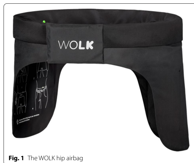
Fig. 1 The WOLK hip airbag

This retrospective study is a before- after comparison of the introduction of the WOLK hip airbag in 11 residential care homes belonging to one long-term care organization in The Netherlands. Figure 2 shows the study design and study periods. In the first period (control period), the WOLK hip airbag was not yet introduced.