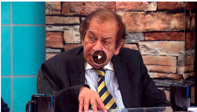
Video 5. Comparison of Second-Generation Basal Insulin Analogs. Available at https://bcove.video/3915xi5 .

Although both Gla-300 and IDeg provide stable insulin concentrations for more than 24 hours, they have unique mechanistic differences; Gla-300 is released freely into the circulation from microprecipitates, whereas IDeg, once injected, forms large multihexameric complexes in the subcutaneous tissue and binds to albumin in circulation (29–33).