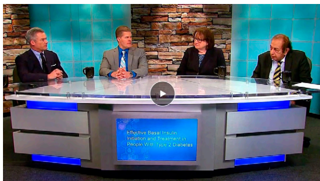
Video 1. Introduction. Available at https://bcove.video/2Q2Rb9b .