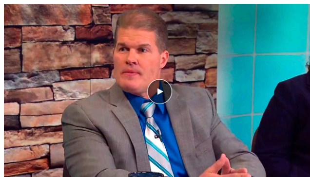
Video 2. Basal Insulin Therapy—Balancing Glycemic Control With Risk for Hypoglycemia. Available at https://bcove.video/3h3Y85h .

The achievement of tight glycemic control reduces micro- and macrovascular complications, and adherence to treatment improves quality of life and decreases health care costs (3–9). The authors discuss the association between A1C reduction and microvascular complications, as reported in the UK Prospective Diabetes Study (9).