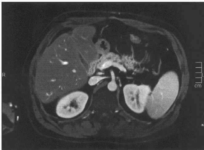
Fig. 3. Liver MRI with contrast medium (May 19, 2014). T1-weighted MRI in an axial plane; follow-up after hepatic resection of segments II and II and local excision of metastases in segments IVb and VI. No evidence of disease.