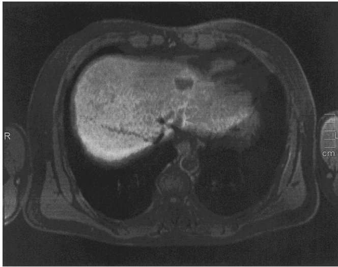
Fig. 2. Liver MRI with contrast medium (November 4, 2013). T1-weighted MRI in an axial plane; partial remission of liver metastases in segment III (arrows) after four cycles of second-line chemotherapy with mFOLFOX4 plus bevacizumab.