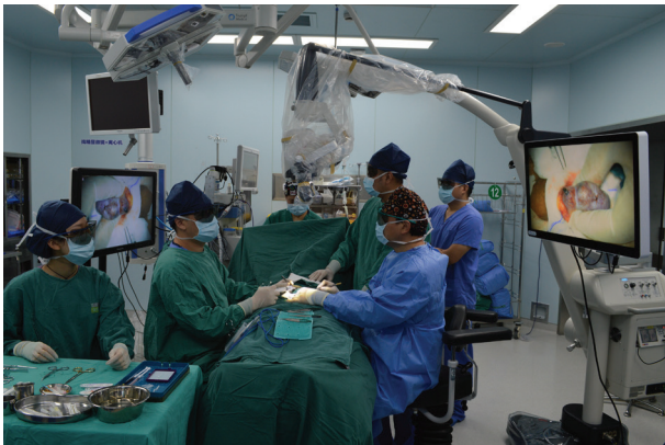
Figure 1: Operating room setup with the 3D digital image microscope system. The telescope, which is attached to its holding arm and comes from the assistant's right side, is held over the surgical field. The assistant sits on the opposite side of the surgeon. The surgeon controls the microscope with the use of a foot pedal. One video monitor is positioned on the surgeon's side, and another is positioned on the assistant's side. The entire surgical staff have the same view as the surgeon via the use of polarization glasses through the video monitor. 3D: three-dimensional.

(8) the placement of sutures in the muscularis and adventitial layer was located precisely in between the two previous mucosal sutures with a 9-0 monofilament proline single-armed needle; and (9) the approximator was turned over and folded in the opposite direction to expose the back wall of the anastomosis ( Supplementary Figure 1d ). The mucosal layer was approximated with six interrupted 10-0 monofilament sutures, and twelve interrupted 9-0 sutures were placed to close the muscularis and adventitial layer. The entire procedure lasted 245 min and was captured on a 3D digital high-definition video.