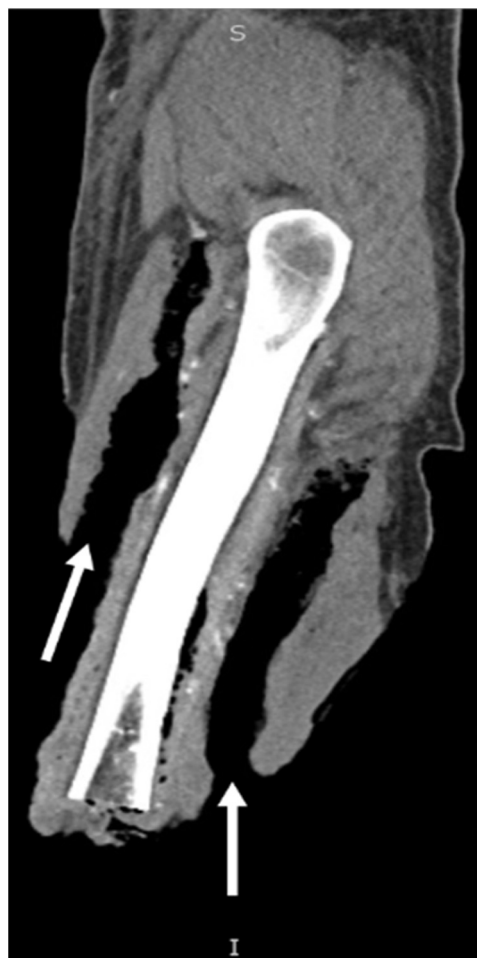
Fig. 1. CT scan of right lower extremity. Extensive air is shown tracking superiorly within the anterior and posterior compartments of the thigh (notated by white arrows).

NF has a median mortality rate of 32.2%, which makes rapid diagnosis and aggressive treatment critical for the survival of the patient [8]. Early diagnoses can be challenging, and a high index of suspicion is essential. Successful treatment modalities include prompt surgical debridement and broad-spectrum antibiotics [9]. A C-reactive protein was not initially drawn and a laboratory risk