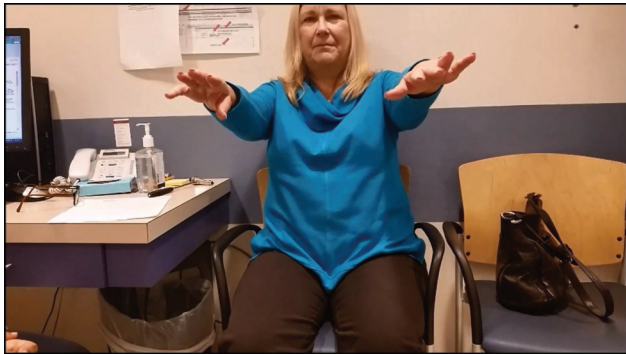
Video 1. Pre-surgical Evaluation Showed a Postural, Kinetic, and Intention Tremor in Both Hands, Left Greater than Right. With the hands outstretched there was mild dystonic posturing of the digits.

Second, does the presence of dystonic features alter DBS target selection from the conventional ventralis intermedius (Vim) target in ET?