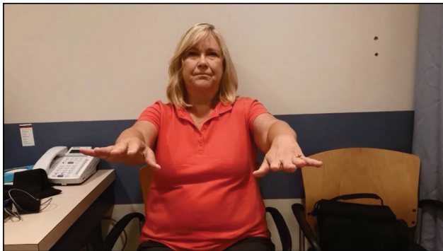
Video 2. Six-month Post-surgical Evaluation, with Significant Improvement in the Left Hand Tremor and Dystonia. Right ventralis intermedius targeting coordinates 14 mm lateral and 5.5 mm anterior from the posterior commissure (PC) with the z-axis at the anterior commissure-posterior commissure (ACPC) plane. Programming settings: contacts 9+, 10-, 11+; 3.7 V; 120 us; 180 Hz.