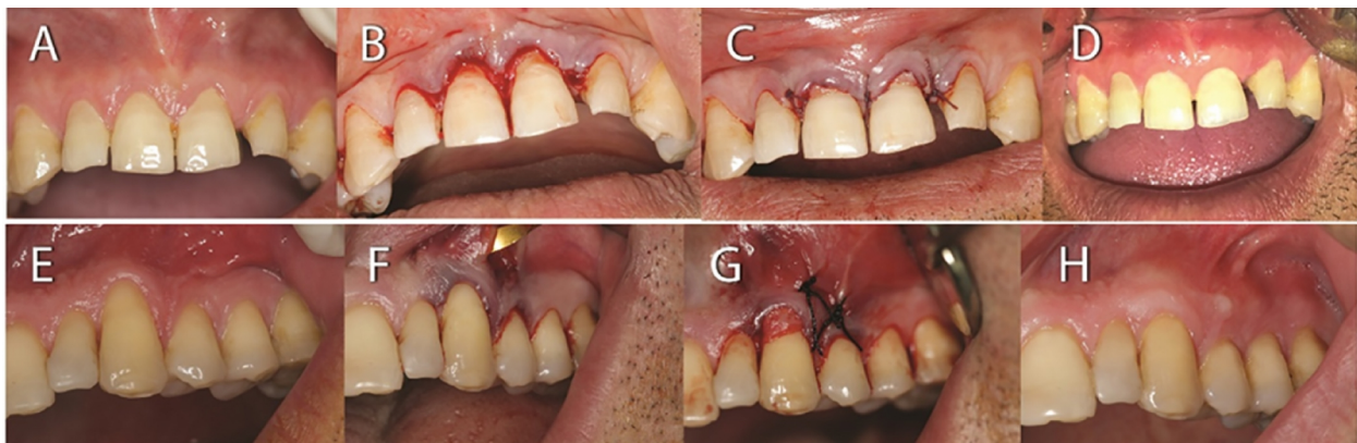
Figure 2. Surgical procedure and follow-up in Langer technique: A. Initial clinical appearance, B. recipient site preparation, C. suturing, D. after 6 months surgical procedure and follow-up in modified semilunar technique: E. Initial clinical appearance, F. recipient site preparation, G. suturing, H. after 6 months