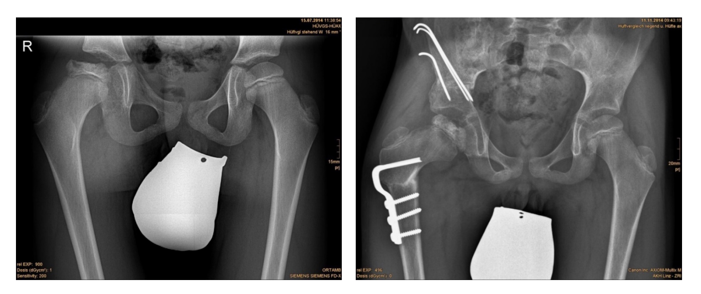
Figure 2. ( left ) Anteroposterior radiograph of a nine-year-old male with LCPD; ( right ): result three months postoperatively.