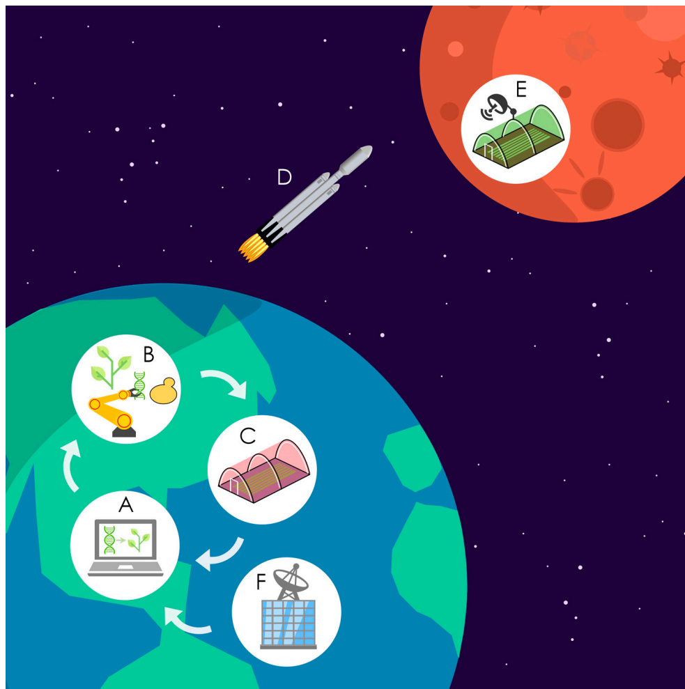
Figure 3. Schematic roadmap for research on adapting life to Mars. The Mars Biofoundry integrates the design of synthetic biology approaches (A) with an automated platform for implementing bioengineering designs in plants and microbes (B) and a facility for high-throughput phenotyping under simulated Martian conditions (C). The process iterates as a design-build-test cycle. Eventually, engineered organisms could be periodically transported to Mars (D) to perform experiments within miniature growth facilities (E). Remote monitoring of performance on Mars (F) would provide critical knowledge to adjust the work carried out at the biofoundry on Earth.

Achieving the proposed goals of adapting plant and microbial life to thrive on a Martian environment in a timeframe compatible with the forthcoming human expeditions to the red planet will require novel approaches. We propose that this formidable challenge can be tackled by establishing a ‘Mars Biofoundry’, that is, an automated and versatile platform capable of expediting the engineering and high throughput phenotyping of biological systems adapted to the environmental conditions that will be encountered on Mars (Figure 3).