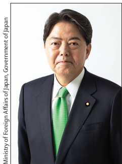
Ministry of Foreign Affairs of Japan, Government of Japan

Nutrition is fundamental for the health and wellbeing of individuals and a basis for sustainable development and economic growth. Investing in good nutrition is an opportunity to positively impact health, increase individual potential and productivity, and support the economic development of nations. The Government of Japan will host the Tokyo Nutrition for Growth Summit 2021 on Dec 7–8. This is the third Nutrition for Growth Summit following London in 2013 and Rio de Janeiro in 2016. The Tokyo Summit aims to review the current status and challenges in nutrition improvement worldwide and to promote global efforts towards better nutrition. At the Tokyo Summit, malnutrition in all its forms will be addressed, including undernutrition, overnutrition, and the double burden of malnutrition, as part of accelerating efforts to achieving global goals and targets, such as the UN Decade of Action on Nutrition (2016–25), the WHO Global Nutrition Targets 2025, and the 2030 Agenda for the Sustainable Development Goals (SDGs).