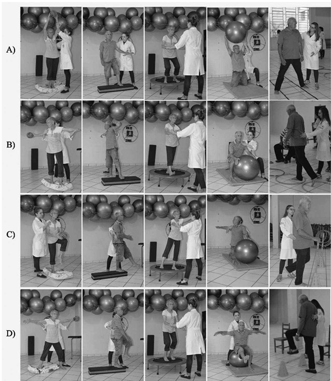
Fig. 3 Physical therapy protocol according to ► Appendix 1 . A) 1 st to 8 th therapy. B) 9 th to 16 th therapy. C) 17 th to 24 th therapy. D) 25 th to 32 nd therapy.