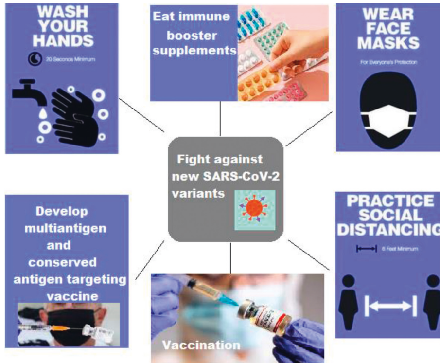
FIGURE 2: Safety precautions used to avoid COVID-19 new variants infection.

The world has been terrified by the SARS-CoV-2 outbreak. There is a need to understand the pathophysiology of the virus, find a solution, and in the meanwhile fight against the COVID-19 pandemic. This review attempts to give recent Information regarding COVID-19 variants to better comprehend this changing novel virus and its relevance.