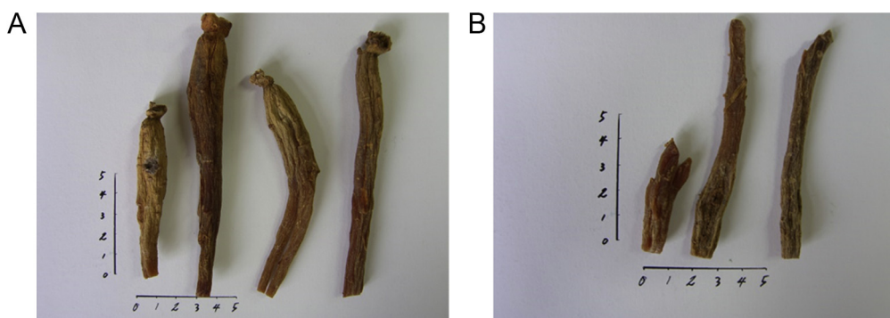
Fig. 1. Photographs of the 4-yr-old (A) red ginseng ( Panax ginseng ) and (B) red fine ginseng ( P. ginseng ) used in the study.

with ultrasonication, to develop a preparation containing highly concentrated ginseng-activated prosapogenins, such as ginsenosides Rg3, Rg5, and Rk1, and to provide basic physicochemical information on the same preparation.